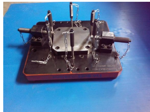
Fig. 3.4.2. Isometric view of Receiving Gauge without job