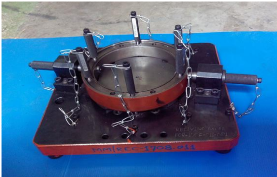
Fig 3.4.4. Isometric view of Receiving Gauge with job