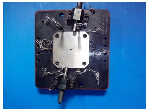
3.4.1. Top view of Receiving Gauge without job