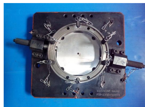
Fig 3.4.3. Top view of Receiving Gauge with job