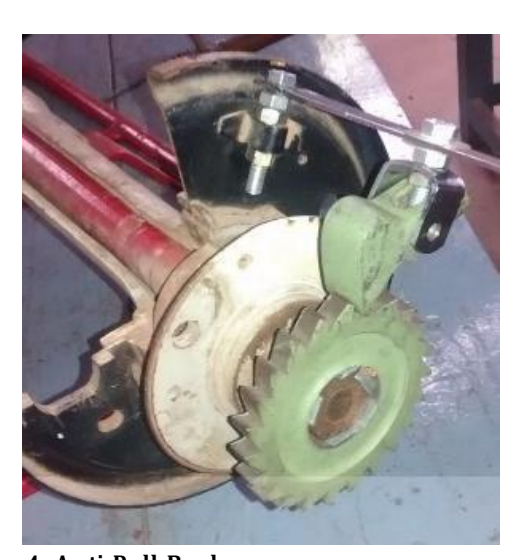
Figure 4: Anti Roll Back Mechanism