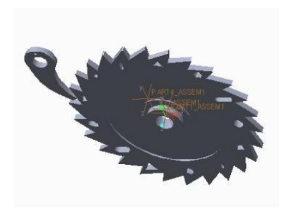
Figure 2. Three dimensional model of Ratchet &

The material considered for ratchet and pawl are