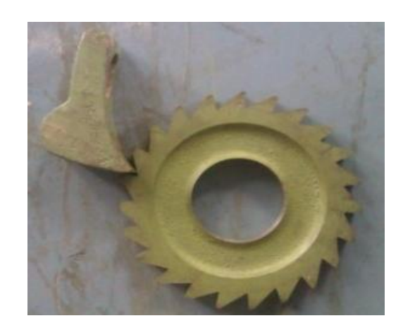
Figure 3: Fabricated Ratchet and Pawl Mechanism