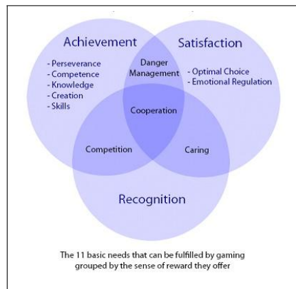
Fig -1: Requirements of gaming application