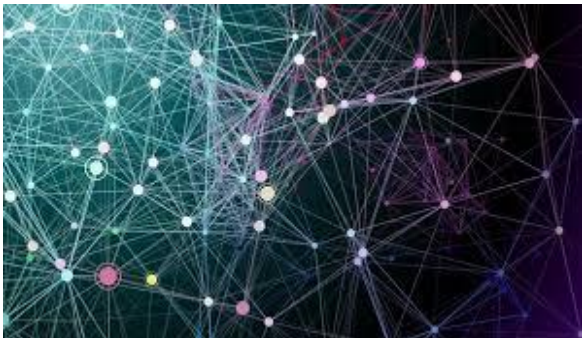
Fig-2: An image of Big data

Volume. Volume of data stored in enterprise repositories have grown from gigabytes to petabytes. Many factors contribute to the increase in data volume like transaction-based data stored through the years, unstructured data streaming in from social media etc. Huge amounts of sensor and machine-to-machine data being collected. In the past days, excessive data volume was a storage issue. But with decreasing storage costs, other issues emerge, including how to determine relevance within large data