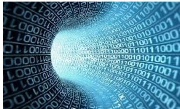
Fig -1: An image of Big data

by cheap and numerous information-sensing mobile devices, aerial (remote sensing), software logs, cameras, microphones, radio-frequency identification (RFID) readers, and wireless sensor networks [2][3][4] . Big data "size" is a constantly moving target, ranging from a few dozen terabytes to many petabyte of data. (1 petabyte is 1000 terabytes)