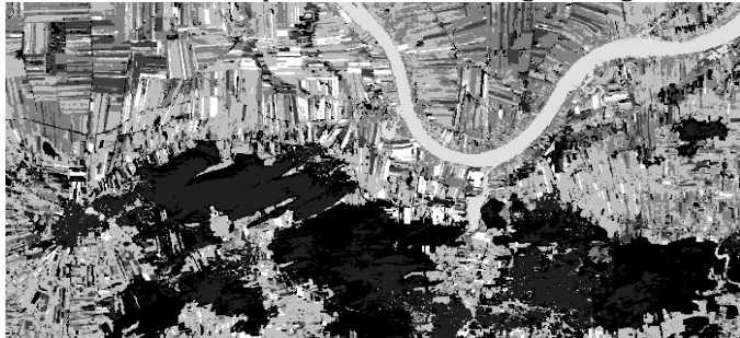
Fig 1. Existing classified sample image

combination of both remote sensing data and non-remote sensing data. For example, the efficiency and accuracy of the information can be improved in support of GIS data. Existing systems have a problem that we cannot differentiate between crops which give same color on sensing by satellite. Hence we need to overcome this drawback by developing a new algorithm which will be based on supervised learning algorithms.