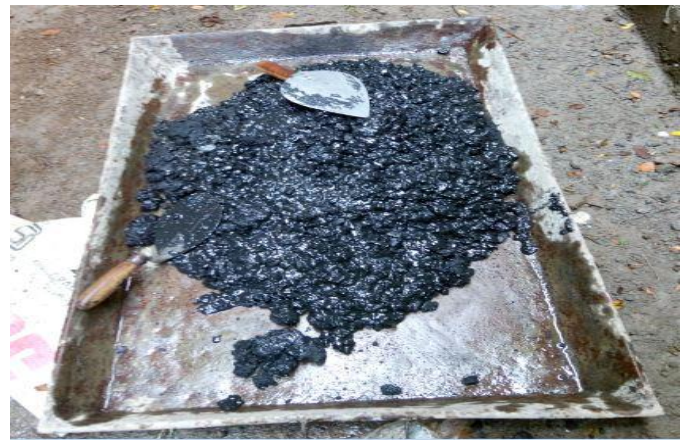
Fig -1: Silica fume based fresh geopolymer concrete.

mixing, in three layers and compacted with manual strokes and vibrating table.