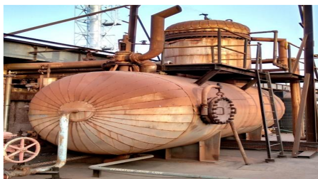
Fig No. 3 De-aerator & FW Storage

A minimum bypass arrangement is provided in the feed pump discharge line to bypass the minimum quantity of water from the feed pump. The arrangement includes a solenoid energized pneumatically operated bypass valve. In the event of raise of pump discharge pressure, which is due to partial or full closure of the feed control valve, or the closure of the feed pump delivery valves, the bypass valve opens. The command for open/close is generated by the DDCMIS in the event the feed water flow drops below the minimum flow permitted.