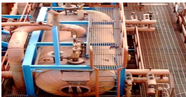
Fig. No.4 Boiler Steam Drum

Under any circumstance, if the feed water flow comes below the preset value. The minimum flow (solenoid energized pneumatically actuated) valve LV31003 is actuated. This safeguards the boiler feed pump against failures due to no flow.