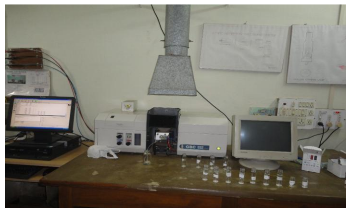
Fig 2.1: Atomic absorption spectrophotometer