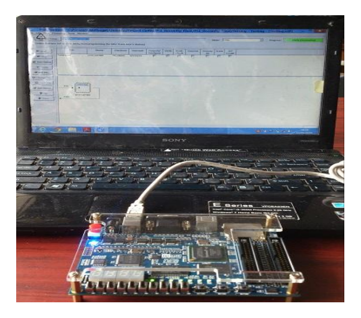
Fig -3: Hardware setup for TRNG.

The proposed TRNG is realized in Altera cyclone-III development board by writing parameterized VHDL code for it in Altera Quartus-II software. The FPGA development board has four on chip PLLs out of which two are used to generate CLJ and CLK signals. Fig.3 shows the complete hardware set up of the TRNG.