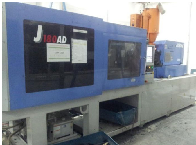
FIGURE: "JSW 180" Injection molding machine

For conducting the experiments the setting of the process parameters has been done as per the given values in Table-1