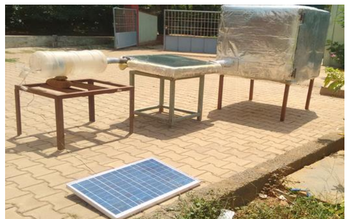
Fig -1: Experimental Setup of the Solar Dryer

A blower of blowing capacity 0.36 \text{ m}^3/\text{min} was chosen from the design calculation for this dryer. The solar collector was made of size 0.8\text{m} \times 0.8\text{m} . The drying chamber was made of aluminium sheet and was insulated using glass wool with aluminium foil. The drying chamber was made of size 0.9\text{m} \times 0.9\text{m} \times 0.9\text{m} .