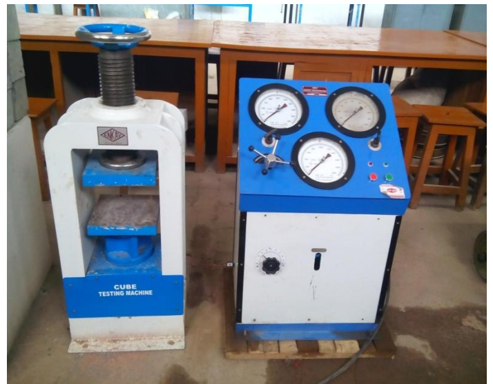
Fig -1: compression testing machine