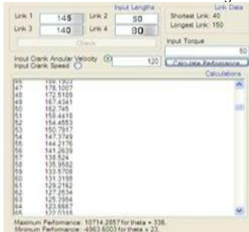
Fig 5.1 Standard Performance Reading