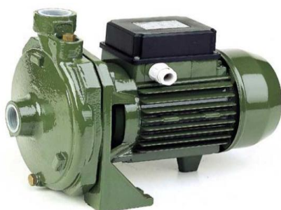
Fig. 1 Centrifugal pump

Common uses include petroleum, water bodies, and petrochemical pumping. The function of the centrifugal pump is converting potential energy of water pressure into mechanical rotational energy.