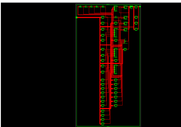
Fig -4: RTL of encoder