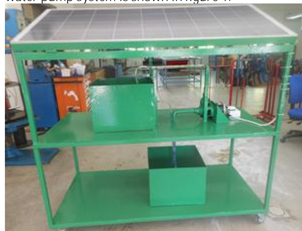
Fig.1.Assembly of solar water pump system 4.9 Bill of Materials

A different part of solar water pump system has been made and then assembled together. An assembly of solar water pump system is shown in figure 1.