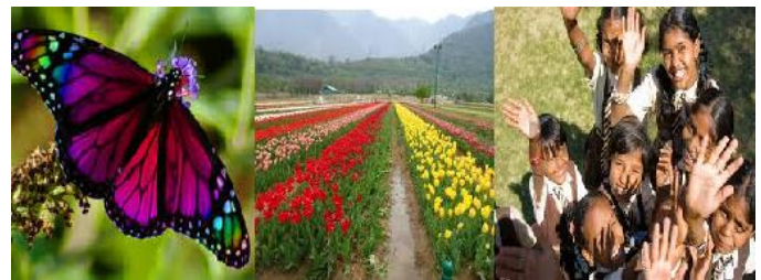
TABLE II. RECORDED RESULTS OF PERFORMANCE EXPERIMENTS