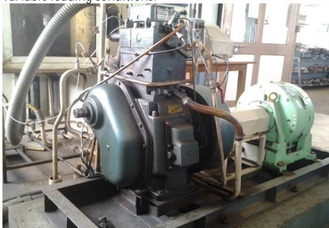
Fig - 1: Computerized Single Cylinder Diesel Engine Test Set Up

The Performance test were conducted on a computerized single cylinder, four stroke, direct injection, water cooled diesel engine test rig. The engine was directly connected to eddy current dynamometer for variable loading conditions.