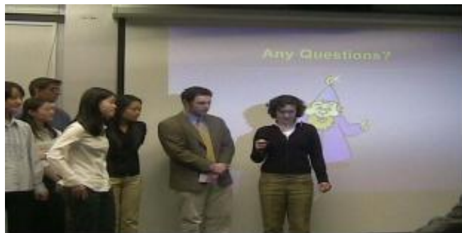
Figure 1(b): The video recording may be of the discussion with audience in the question answer session.

For these kinds of video lectures as in 1(a), MIT has suggested the online version of 2.002, which provides the search by keyword and organized as a set of basic concepts in a tree structure format with subtopics are shown by branches of the tree.[6]