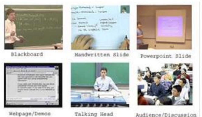
Figure 2: Different types of scenes and different presentation formats in instructional videos.[6]

The retrieval of text is especially done by Optical Character Reorganization (OCR) and Automatic Speech Recognition (ASR). The technologies have been developed which are using different tools for efficient retrieval.