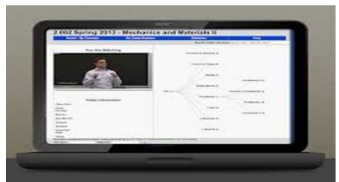
Figure 1 (a): A recent video lecture image from MIT

Nowadays the video recording is done based on multi-scene format in which the frame may contain multiple scenes at a time, like professor explaining the slide in half part of the frame and slides are shown on next half part as shown in figure 1(a) or having discussion after finishing the slide presentation as shown in fig. 1(b). [1][9]