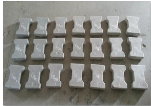
Fig -1: Paver Blocks ready for test

for further testing. The paver blocks that were cast are shown in Fig.1.