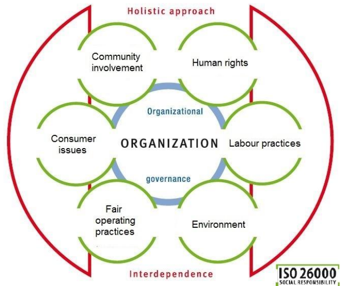
Fig.-3: Holistic approach of CSR based on ISO 26000 and organizational governance.

Based on ISO 26000, the governance of organization includes a holistic approach related to CSR (Fig. -3).