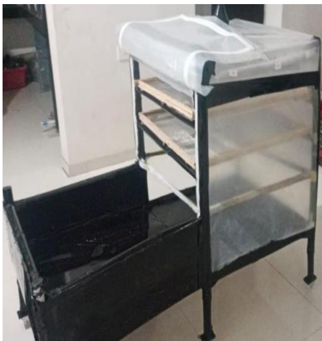
Fig. Actual 3D Model