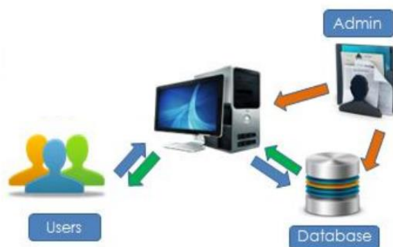
Fig 1. System Architecture Design

A price comparison website functions as a platform or mediator between the consumers and the sellers. Customers can view various price lists for the product they have selected, which enables them to make an informed decision on which to select in order to save money. Additionally, it serves as a tool to assist customers become more price conscious so they won't feel duped by advertisements from merchants who falsely claim to be delivering the best deal when, in fact, they are not. A Shopping application for decision assistance is a tool designed to assist customers in making decisions about what to buy for themselves (Heijden, 2005). It can assist the customer in selecting the less expensive product after doing a product comparison. It assists the customer in comparing the product's price, size, and brand at two or three shopping centers in the Kampar area to determine which product is more worthy of their attention. The application system then makes a decision for the customer after computing the total price of the product list. Customers can choose which product they wish to buy and two or three shopping centers from the application system.