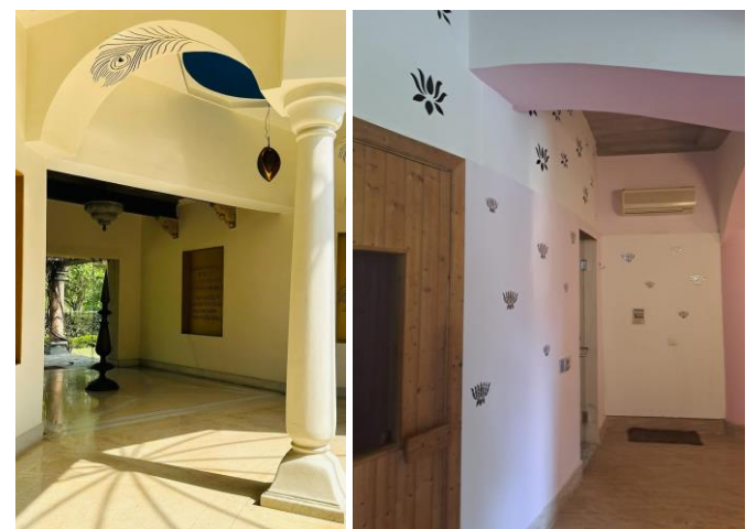
Fig -2: Symbolism detailing at Tree of Life Resort

Likewise, Hotel Riomar uses a color as a primary theme which is rooted to Spanish culture. All the spaces has this color integrated one way or another in the interior elements, tying the whole place together.