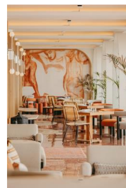
Fig -3: Color theme reflected in different aspects at Hotel Riomar

Likewise, Hotel Riomar uses a color as a primary theme which is rooted to Spanish culture. All the spaces has this color integrated one way or another in the interior elements, tying the whole place together.