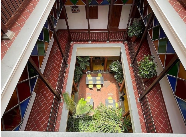
Fig -4: Teakwood and courtyard from Tamil architecture and stained glass from French colonial influence in Maison Perumal, source: tripadvisor.

Maison Perumal in Pondicherry showcased a harmonious blend of French colonial and Tamil architectural elements, with teakwood columns and stained glass features complementing the traditional furniture styles.