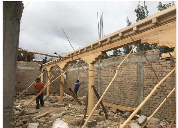
Fig -1: Arch details of Dolkhar done by local craftsmen

A common practice observed across the case studies was the use of a single cultural parameter as a focal element, serving as the primary means of cultural representation. For instance, in the Dolkhar hotel, locally sourced materials and traditional crafts took center stage, with the building and interior elements crafted by local artisans using indigenous techniques. Similarly, the Tree of Life Resort in Jaipur prominently featured traditional motifs and symbolism, with inlaid floral patterns and elements like peacock motifs adorning various surfaces.