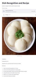
Fig. 2 Output ScreenShot