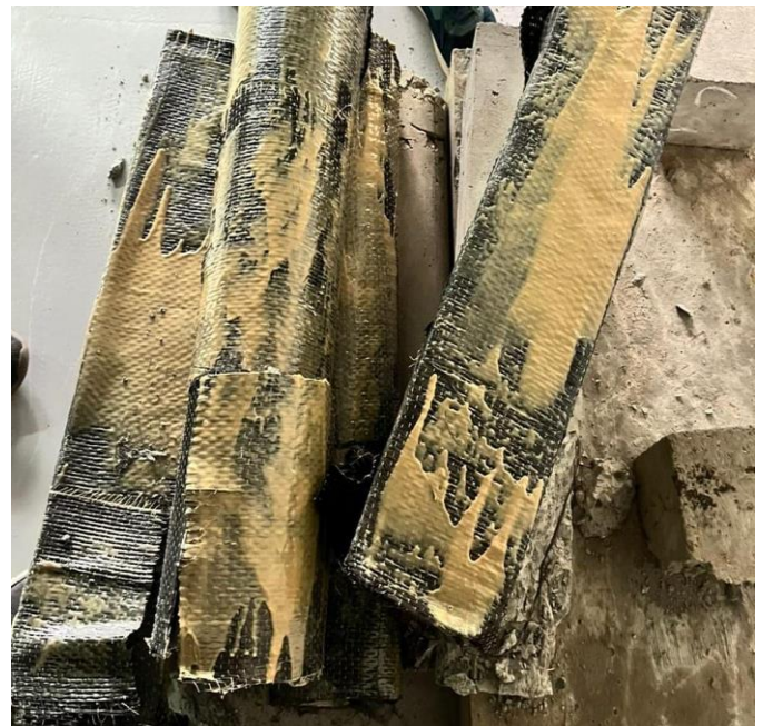
Fig -3: Wrapped Square and Circular Column failure after test

After the application, all columns were tested to find the compressive test for them to compared the effect of shape on increase in load carrying capacity due to application of CFRP. Visual observations were made to document failure mode like concrete cracking, CFRP debonding etc.