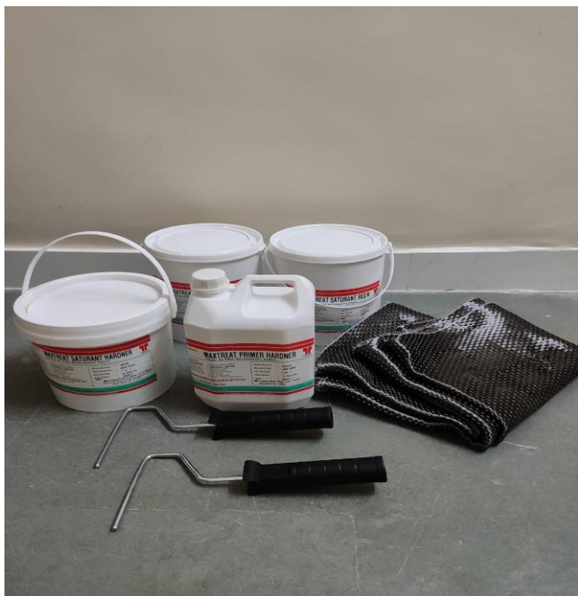
Fig -1: Materials used for Experimentation

It has been well established that CFRP confinement is much less effective for square columns than for circular columns, even with the rounding of corners. This is because in the former, the confining pressure is non-uniformly distributed and only part of the concrete core is effectively confined. Failure generally occurs at the corners by FRP tensile rupture. The stress-strain curves are more likely to feature a descending branch, but in such cases FRP confinement normally provides little strength enhancement. The effectiveness of confinement increases as the amount of FRP or the corner radius increases, and as the aspect ratio of the section reduces.