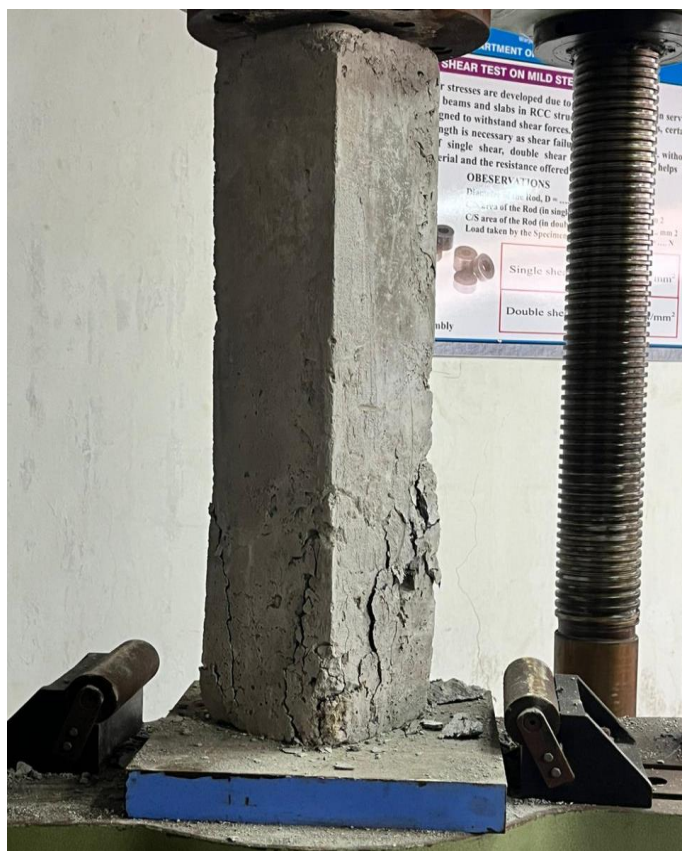
Fig -3: Unwrapped Square Column on UTM

2.) For comparison with previous research data, peer research paper is used. Notably among the research paper selected for comparison purposes are Riad Benzaid, and Habib-Abdelhak Mesbah, "Circular and Square Concrete Columns Externally Confined by CFRP Composite: Experimental Investigation and Effective Strength Models", Fibre Reinforced Polymers - The Technology Applied for Concrete Repair , pp.167-201, 2013. The other research paper used by is Zhenyu Wang, Daiyu Wang, Dagang Lu, "Behavior of Large-Scale Circular and Square RC Columns Confined with Carbon Fiber-Reinforced Polymer under Uniaxial Compression", Advanced Materials Research Vols. 163-167 , pp 3686-3693, 2010