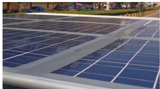
Fig -3: Solar Pane of 21Volts/ 12 Amps

The solar panels we have used are flexible polycrystalline solar panels. Flexible polycrystalline solar panels offer some potential advantages for use on EVs. Here's a breakdown: