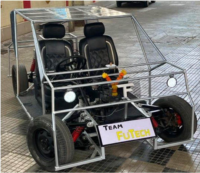
Fig -7: Actual Model