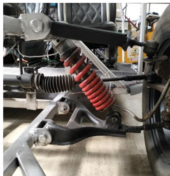
Fig 4: Lower arm

The lower arm suspension encountered issues stemming from the weight of the suspension system, leading to deformation. To address this, hammering and welding operations were employed to restore structural integrity and resolve the bending problem.