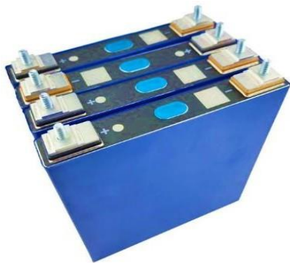
Fig -2: Lithium-ion battery of 60v/70Ah

The battery we used is a Lithium-ion battery. Lithium-ion batteries reign supreme in electric vehicles (EVs) due to several key characteristics that perfectly complement the demands of electric propulsion.