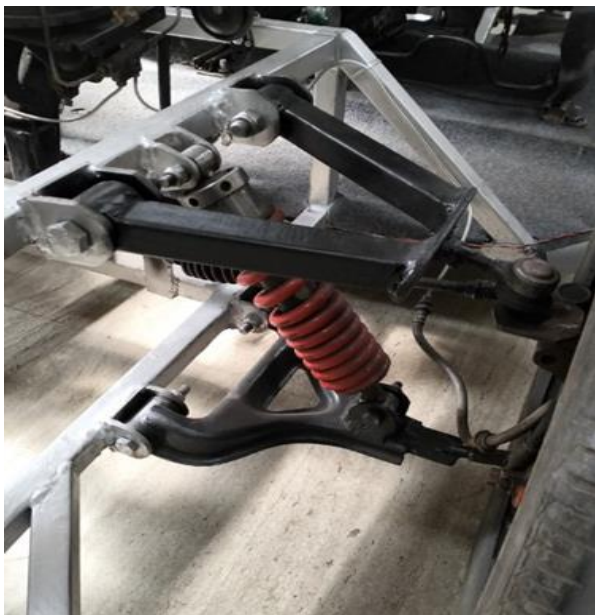
Fig -5: Upper arm

Fabricating the upper arm proved time-consuming, initially utilizing circular rods. However, after a thorough survey, it was determined that using square bars with appropriate measurements akin to the lower arm proved to be a more suitable approach. This adjustment optimized the structural integrity and functionality of the upper arm component.