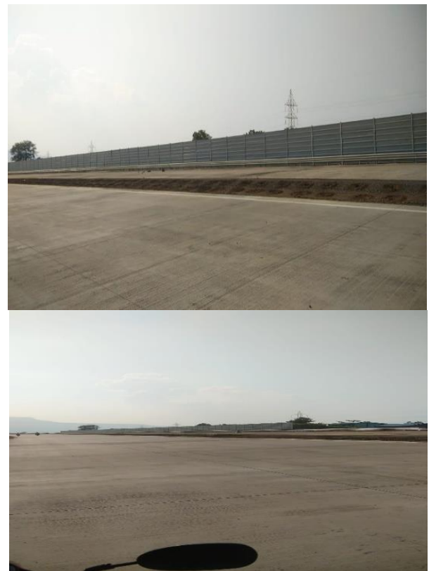
Figure1: Samruddhi Mahamarg

The Samruddhi Mahamarg, also known as the Nagpur-Mumbai Super Communication Expressway, is an ambitious infrastructure project in the Indian state of Maharashtra. It's designed to be a high-speed, access-controlled, and eight-lane expressway that will connect the city of Nagpur in eastern Maharashtra to Mumbai in the west. The engineering is very well done and there are no shortcomings in it. But the speed of operation is too high (about 120kmph). Hence, the reaction time available is too less (about 0.7 seconds). The tyre gets heated up and the air expand and hence, they burst. We cannot completely stop the accidents but we can reduce them in some percentage using the sensor. We have selected the Doppler Radar for our project from all the sensors. Doppler radar sensors operate based on the doppler effect, which detects frequency shifts in radio waves reflected off moving objects (e.g. vehicles). Doppler radar sensors operate based on the Doppler effect, which detects frequency shifts in radio waves reflected.