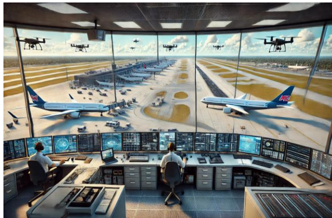
Figure 1: UAV impacts to ATC

deploying more sophisticated tracking systems, and establishing comprehensive regulatory frameworks that address the unique requirements of UAV operations [10, 11, 12]. As UAV usage expands across various industries, including delivery, agriculture, and surveillance, the importance of improving detection technologies and refining traffic management strategies becomes ever more critical for ensuring the safety of both manned and unmanned aircraft in shared airspace [3, 5, 7, 9].