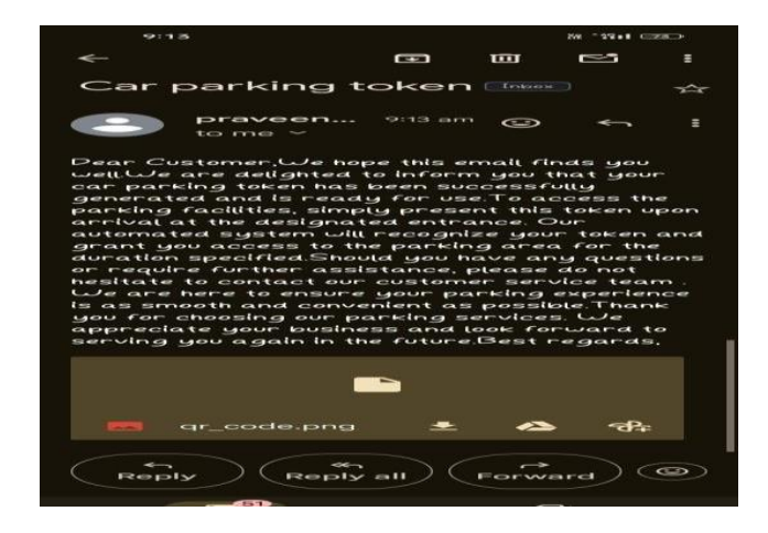
Figure 5- E-token for user