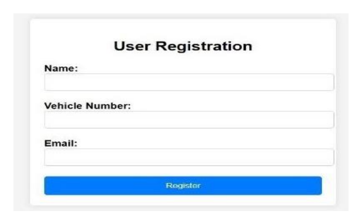
Figure-4 registration page.

Volume: 11 Issue: 10 | Oct 2024 www.irjet.net p-ISSN: 2395-0072