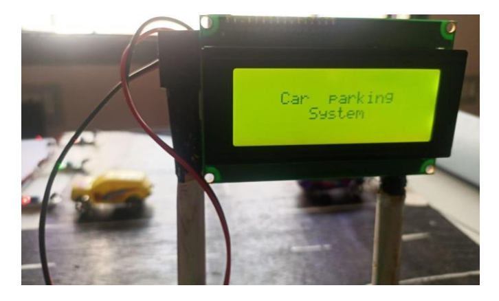
Figure-2 Implementation of Automated parking system.

The following pictures show the result obtained for the paper and each one of the pictures are described.