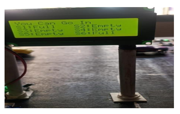
Figure-3 Implementation of slots in Automated parking system