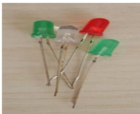
Fig -2: LED Bulb

A light-emitting diode (LED) is a bulb and a semiconductor device which emits light when current is passed through it. The working principle behind this is, Electrons in the diode of semiconductor recombine with holes of electrons and release energy which is in the form of photons. The color emitted by these lights which is related to the packets of energy, photons found by the energy which is required for electrons to jump the gap of band system of the semiconductor.