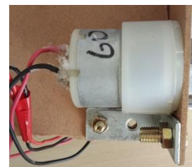
Fig -4: DC Motor

300 RPM with 12V Johnson Geared DC Motor of Grade-B is a simple DC motor having a featuring metal gearbox for rotating and driving the shaft of the motor, so that it is a mechanically combined electric motor powered from DC supply. The uniqueness of The Johnson Geared Motors is compact size with massive torque and speed characteristic. Johnson Motors are having side shaft which are also known as off-centered shaft and is having six M3 mounting holes. The shaft is equipped with metal bushes and it makes these DC gear motors as Shaft wear resistant. The shaft is having a hole for better moving and coupling. It is one of the best motor between DC Geared Motor and Side shaft Motors at the economical cost. The geared DC motor which is commonly used, will run smoothly and uniformly in the approximate average voltage range 6 to 18 V DC and shaft rotates 300 RPM at 12V supply which also provides the torque of 2.5 kg-cm at an RPM of around 300.