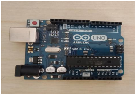
Fig -1: Arduino Uno

The power required to run the Arduino Board can be supplied through making a connection to laptop using a USB cable or hooking an ACDC power supply.