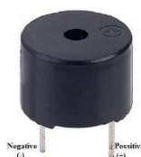
Fig -3: Buzzer

An audio sound signaling device like a buzzer or beep, is an electromechanical device or piezoelectric device or mechanical type of device. The important function of this is to convert the signal from arduino to sound. Usually, the buzzer is on through DC voltage which will be used in alarm devices, timers, computers, printers etc. Based on the various types of designs, it can be used to generate different sounds like siren, bell, alarm and music.