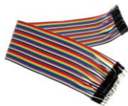
Fig -6: Jump Wires

Jump wires are small metal connectors used to close or open a circuit. Jumpers have two or more connection points to regulate the power of electrical circuit board. The main function of jumpers is to configure or change the settings for computer peripherals, such as the motherboard. Suppose your motherboard supported intrusion detection. A jump wires can be used to enable or disable it. jumper wires are used to modify a circuit or find any problems in a circuit. They are also best used to bypass some part in the circuit which does not contain a resistor and is not required which includes a stretch of wire or a switch.