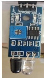
Fig -5: IR Sensor