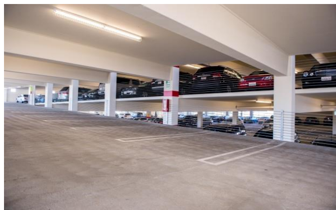
Fig 1:- Current parking system

The multilevel car parking has to deal with the traffic congestion which leads to loss of time, the hydraulic car parking system prevents the traffic congestion as the parking is automated and also prevents change caused during manual parking in multilevel car parking. The hydraulic car parking is durable and secure which consist of piston cylinder arrangement, counterbalance valve, directional control valve, pressure relief valve, pump, motor, filter and reservoir.