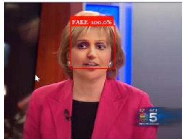
Fig -V: Expected Results

Table II can be used to draw a lot of inferences. Throughout the table, Transfer Learning has had a significant effect on accuracies in both Resnet50 with LSTM and Resnext50_32x4d with LSTM models. With the exception of one block when we used ResNext with Transfer Learning with LSTM sequence length 60, the strong influence of increasing sequence length can be seen invariably throughout the table.