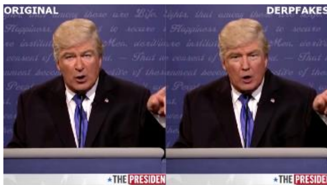
Fig -I: Original vs Deepfake

Intuitively, the encoder detects face angle, skin tone, facial expression, lighting, and other data needed to recreate individual A.