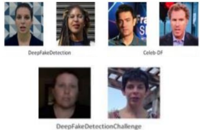
Fig -II :Dataset Distribution

The task of Deep-Fake detection is framed as a binary classification task, with real and fake images as the two classes. We use supervised learning to train a Convolutional Neural Network on sets of real and false samples to estimate the likelihood of test images being influenced by deep-fake manipulations. The various Deep-Fake video datasets used in this method are described in this section, as well as the process for curating image datasets for training and testing.