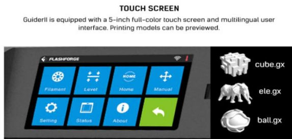
Fig – 6: Touch Screen