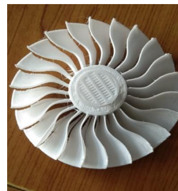
Fig – 9: Impeller

A centrifugal pumps impeller is a revolving part that accelerates fluid away from its center of rotation, transferring energy from the pump's motor to the fluid being pumped.