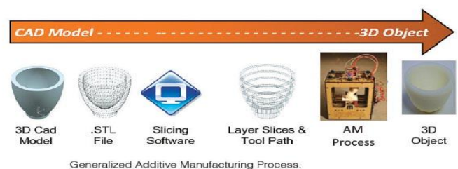
Fig - 4: Working Process

The 3D CAD model will be stored in one of the file formats, typically STL. A slicer does what its name implies: it slices the 3D model. It specifies the tool path that the printer should use to properly print each layer of the sliced model and how each layer should be produced. A slicer is a component of 3D printing software that connects virtual and physical models. The digital model is converted into G-code, the printing instructions, via the 3D printing slicer software. The printer receives these instructions and, in response, until the object is finished.