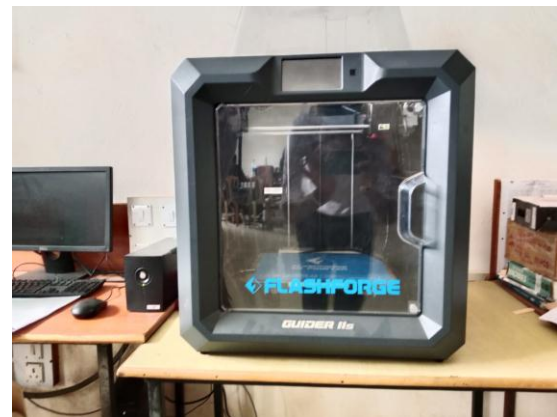
Fig - 11: Jaw Chuck

the layers. If G codes are not generated properly the problem may occur in printing.