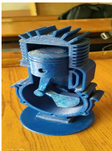
Fig – 8: Stroke IC Engine

Engine is the machine used for converting any form of energy into motion and mechanical force. The engine has connecting rod, piston, crankshaft, cylinder, flywheel, spark plug, inlet and outlet ports. 2 stroke engine has 4 strokes known as Suction, Compression, Expansion, Exhaust. It is the engine which completes its cycle in 2 revolution and has its 1 stroke of 90 degree. A two-stroke (or two-stroke cycle) engine is a type of internal combustion engine that performs two piston strokes (up and down movements) throughout a power cycle, which is finished in one crankshaft revolution. A power cycle in a four-stroke engine involves four piston strokes over the course of two crankshaft revolutions. In a two-stroke engine, the intake and exhaust (or scavenging) activities happen simultaneously at the end of the combustion stroke and the start of the compression stroke.