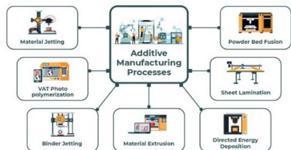
Fig - 2: Types of Additive Manufacturing Processes