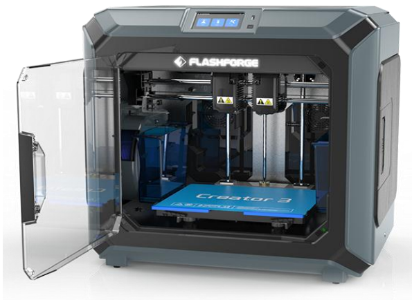
Fig – 5: 3D Printing Module

result is achieved. A cross-section of the object that has been thinly cut can be imagined in each of these layers. For example, a milling machine can be used to hollow out or cut out a piece of metal or plastic. Subtractive manufacturing is the alternative to additive manufacturing. When compared to conventional production techniques, 3D printing uses less material to create complicated designs.