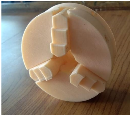
Fig - 10: Jaw Chuck

A specific type of clamp known as a "chuck" is made to hold radially symmetrical items, most notably cylinders. A chuck holds the revolving tool in a drill, mill, and transmission; in a lathe, it holds the rotating workpiece.