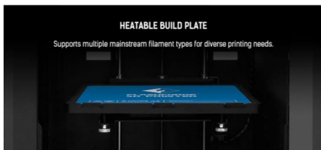
Fig – 7: Heatable Build Plate