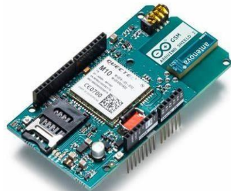
Figure 6: GSM Module

A GSM module is a small electronic device that allows a device to communicate over the Global System for Mobile Communications (GSM) network. The GSM network is a cellular network that is used by mobile phones and other devices to transmit voice and data. GSM modules typically consist of a modem and a SIM card slot.