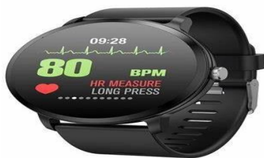
Figure 8: Smartwatch

An electrical instrument called an O2 Sensor is used to gauge the human body's O2 saturation. 95 to 100% of O2 is considered typical. The system's brain is the ESP32. The poisonous gases (sulfide, CO 2 , ethane, methane, nitrogen) are detected using the MQ135 gas sensor. The O2 sensor measures the human body's oxygen content. OLED displays the gas concentration as a percentage (ppm value). If the user's oxygen level drops, an alarm will sound constantly for five minutes. If the situation persists, however, the smartwatch will dial 911. If the oxygen level rises, the alarm will automatically turn off.