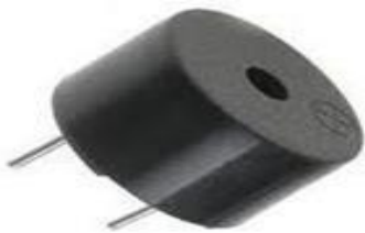
Figure 5: Buzzer

A buzzer is an electronic device that is designed to produce a loud, repeating sound. Buzzer components typically consist of a coil of wire, a magnet, and a spring-mounted diaphragm.