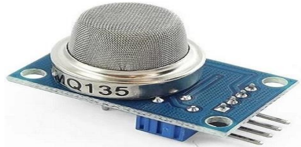
Figure 3: MQ 135

The main job of the gas sensor is to communicate to a microcontroller the number of parts per million (ppm) of contaminants present in the air. This data is then processed by the microcontroller to provide the current air quality index.