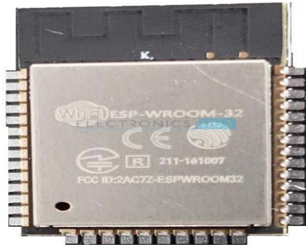
Figure 2: ESP32 Microcontroller

can also be used to control actuators, such as motors, relays, and solenoids, making it a powerful tool for automation and control systems.