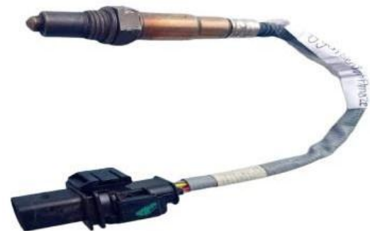
Figure 4: O2 Sensor

An electronic device known as an O2 sensor measures the oxygen level in human beings. 95 to 100% oxygen is considered typical. If the user's oxygen level drops, an alarm will sound continuously for five minutes, prompting them to call for help using their smartwatch. The warning will automatically cease if the oxygen level rises.