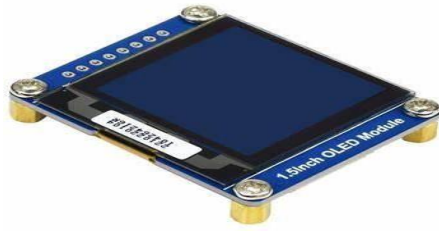
Figure 7: OLED Display

In the area of environmental sensing, where it is being utilized to show crucial information about air quality and gas levels in real-time, OLED technology is one of the most promising applications. The amount of dangerous chemicals like carbon monoxide, nitrogen dioxide, and sulfur dioxide that are present in the air around you can be displayed on smartwatches' OLED screens, acting as a warning system. OLED displays can also measure blood oxygen levels, which makes them a crucial feature for hikers, sports, and persons with respiratory conditions. It is a common option for outdoor activities due to the high-contrast and bright OLED displays, which make it simple to see even in direct sunshine. In conclusion, OLED technology's adaptability has made it a crucial component of contemporary life, with uses ranging from entertainment to health monitoring. OLED displays have a promising future, and we may anticipate seeing more avant-garde applications of this technology in the years to come.