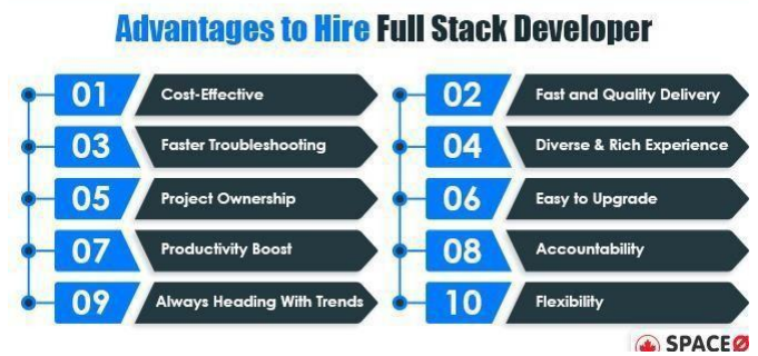
Fig 4. Advantages of FSWD

Refer to the figure 4. for the advantages of FSWD.