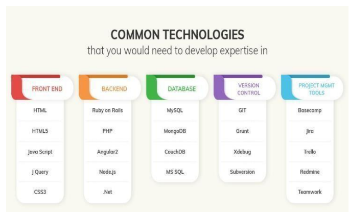
Fig 2. FSWD components

Refer to the figure below which demonstrates the various examples of components of FSWD (Full Stack Web Development).