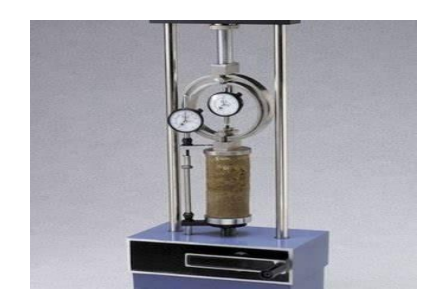
Fig:-6 unconfined compressive strength

The black cotton soil and red soil Unconfined compressive strength is the load per unit area at which an unconfined cylindrical specimen of soil will fail in compression test. The unconfined compressive test has been carried out as per I.S code of practice (I.S 2720 part 10:1973). There were test also conducted with the replacement and introduction of quarry dust and eggshell powder with respective to compaction test results.