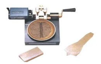
Fig:-4 casagrand apparatus

The liquid limit of black cotton soil and red soil was determined according to I.S:2720 (part V 1985). The liquid limit of black cotton soil was found to be 40% and liquid limit of red soil found 37% there were test also conducted with the replacement and introduction of quarry dust and egg shell powder with respective to compaction test results.