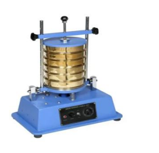
Fig:-1 sieve shaker

Grain size analysis has been carried out as per the I.S. code of practice (I.S.1498:1970).As per the I. S code the given black cotton soil is classified as sandy soil.