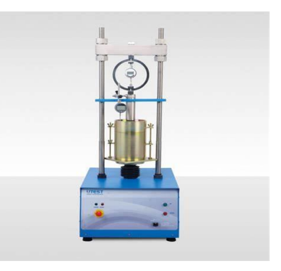
Fig:-7 California bearing ratio

The California Bearing Ratio (CBR) test is a standardized laboratory test used to determine the relative strength of a material such as soil, aggregate, or pavement subgrade. These test measures the pressure required to penetrate a soil sample with a standard piston at a standard rate, and then compares the result to the pressure required to penetrate a standard material (typically crushed rock or gravel) under the same conditions. The ratio of the pressure required for the soil sample to the pressure required for the standard material is known as the California Bearing Ratio, and it provides an indication of the strength and bearing capacity of the soil. The CBR test is commonly used in civil engineering and road construction to design and evaluate pavement subgrades and base courses.