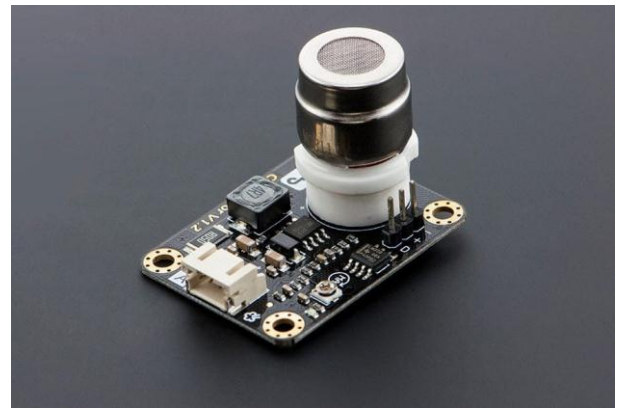
Figure 9. BME Environmental sensor