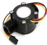
Figure 3. Flow Sensor

In oil and gas industries accurate and reliable oil flow measurement is required for estimating the cost of distribution and generation.. The mostly used type of flow meters are Positive displacement flow meters. In recent days differential pressure flow meters are widely used to measure the oil flow[4].