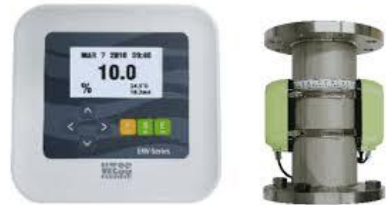
Figure 5. Density Meter

and gasoline and liquid mixtures like Y-grade natural gas liquids (NGL), but can also be used to measure the density of crude oil. The typical installation is in a single-phase liquid stream, but densitometers can be used to measure single-phase gas or vapor. This paper addresses only continuous, on-line liquid density measurement[6].