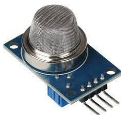
Figure 4. Gas Analyser

Gas sensors are essential for personal safety and environmental protection. These sensors are mainly used to detect and measure actual levels of methane, hydrogen sulphide, carbon monoxide, oxygen along with 50 other gases. This sensor has auto-calibration function that allows for precious calibration of the gas levels. This sensor can store the values and could transfer data to a computer[5].