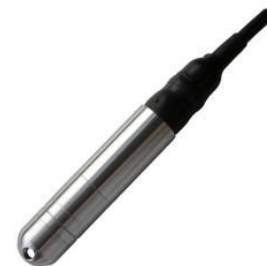
Figure 1. Pressure Sensor

It is a Submersible pressure sensor ranging from 0 – 0.2 bar for measuring the level of a 2 meter oil storage tank. This type of the pressure sensor can be installed directly into a storage tank containing fuel oil. It issues a output signal of 4-20mA with 0.1% accuracy[2].