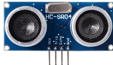
Figure 8. Ultrasonic Sensor

Also it is possible to estimate the amount of oil transferred for billing purpose and to know the supply quantity[10].