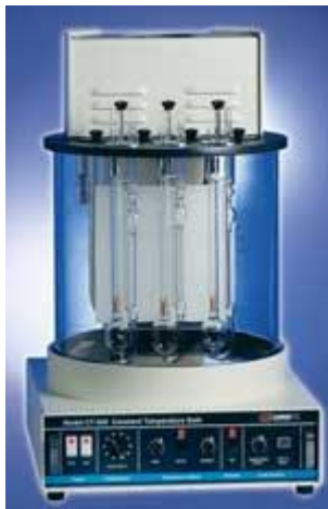
Figure 6. Gas Analyser

Oil viscosity is measured easily using the capillary tube viscometer. It consists of a metal rod that is inserted into the two beakers that are similar to each other. The actual force required for stirring the gear oil will be much more greater than the actual force required to stir the turbine oil.