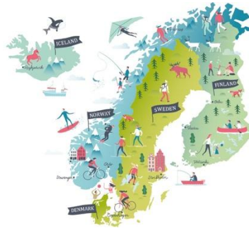
Fig-3:- Explain the Nordic country's major activities to show their green activities for nature (Engheim, 2022).

So, I discuss Nordic policies that they use for their circular economy in an efficient way the Nordic region always makes a long vision plan and execution policies as per policies and the common period of the plan is 10 years (Benediktsson, 2019).