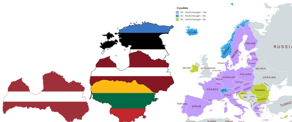
Fig-1: - Explain the economic boundary for small, Mid, and large-scale circular economy.

The circular economy in Latvia is defined as the global step for the economic growth of Baltic states and more focus on global business opportunities to circulate the nature of business in terms of support of government authorities and infrastructure for the business hub. Also, the Latvian government business model supports the new business, Value of development and nature of the business to create the best circular system for the business cycle and with the help of the state budget to minimize the risk of the businesses. Also are major benefits provided for that business that work for environment-friendly products. Because Latvian society always protects and promotes environmentally friendly products. So, companies are more focused to do this kind of business in the Latvian market and helping the circulation of economic growth as per market demand and supplies. Also, the smart business model in Latvia uses an innovative business model to create good business efficacy and protect natural resources from major business activities and always focus on reusable products and recycle management systems in every business profile that works in the Latvian market.