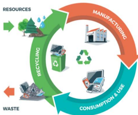
Fig-5:- Circular economy improving the current approach to circularity (EFQM Circular Economy Lens, 2022).

As I India I observe that in my society that I found that people buy eco-friendly products for their daily uses and promote these activities for new generations. Also, people are more educated about these issues with the help of print and digital media. Also, I have gone through government policies for the companies in the circular economy and I found that there are some tax relaxations for new changes in the quality of the product.