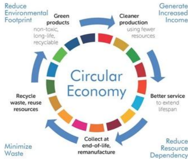
Fig-6:- The concept of circular Economy (CIVILSDAILY, 2021).

The major issue with the implementation of the circular economy in India is to cover the whole of India in a short period. Because due to the land area of India. Also, most of the areas in India belong to rural areas. So there is much more time taking process to educate in a rural area about the circular economy process and explain the benefit of their uses. Also, the manufacturing hub in India is a more complex process because of due lack of a proper training system in every district in India and logistic supplies issues for fulfilling all the requirements according to the market demand and supply.