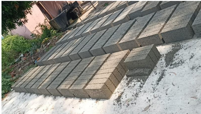
Figure 1: Moulded Concrete bricks

For 1 concrete brick, amount of materials required are calculated according to the mix ratio 1:4:5