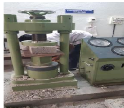
Figure 4: Compressive Strength test

A total of 55 number of bricks of size 4 x 8 x 16 inches were casted and tested for 7, 14, 21 and 28 days. The test results are tabulated.