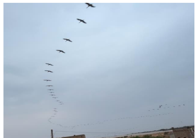
Fig -2: "V" Flight formation