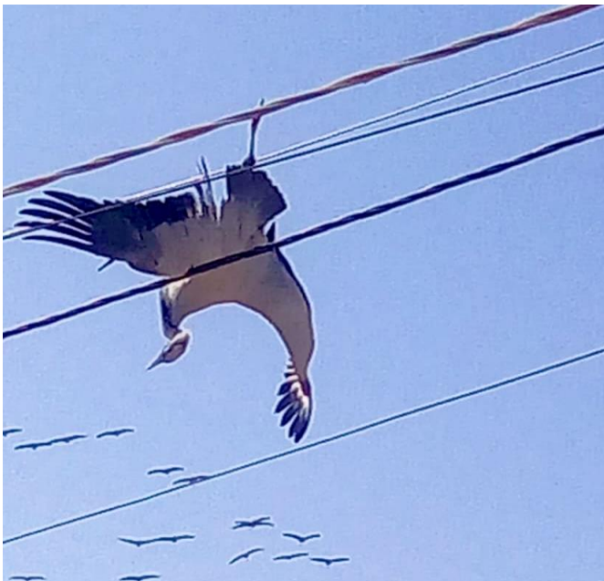
Fig -7: Demoiselle crane collapsed with electric wires.