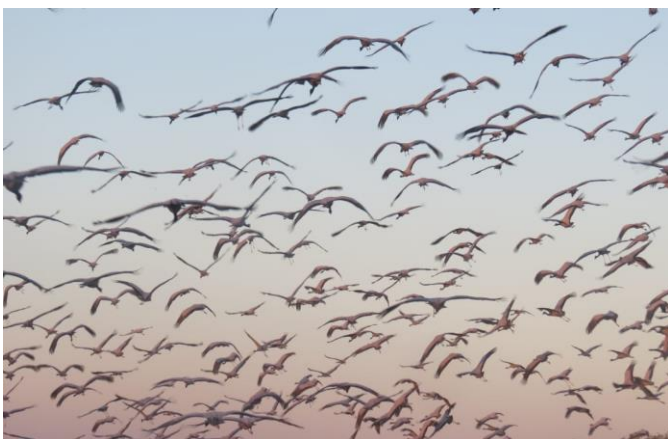
Fig -8: Demoiselle Cranes in Midair.

The population status is summarized in table 1 and their detail is plotted in the line graph shown in figure 4. We recorded 35,000 – 40,000 individuals in the peak month of winters i.e., January and February. They migrate to the thar region of Rajasthan by the month of September, and they stay there till late march and migrate back to their breeding grounds. The major threats causing the mortality of the cranes are summarized in Figure 5. The incidents and mortality rate of the birds are highest at the roosting site, with the primary causes being electric wires and food poisoning. The overuse of fertilizers and pesticides, particularly those with elevated phosphorus levels, can lead to infections in the gut of cranes, ultimately causing diseases and individual fatalities.