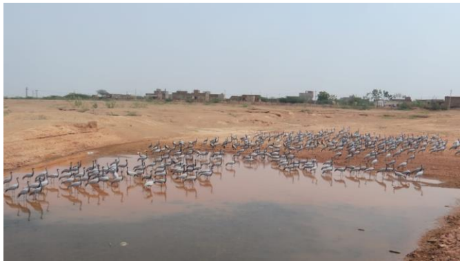
Fig -3: Roosting site (Vijaysagar talab)

In the northern side of the village, there are two water bodies, "Vijaysagar Talab" (Pond) and "Ratri Nadi" (River). Another water body is situated in the southern region of the feeding ground, and that's "Teerjaniyo ki Nadi" (River). These rivers and ponds are used by the cranes as resting sites in the evening and a source of drinking water.