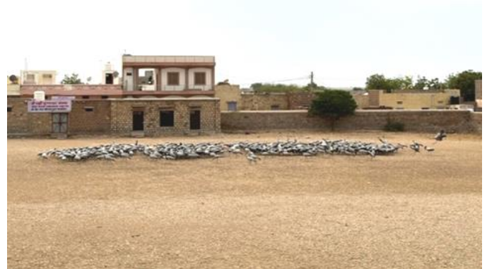
Fig -1: feeding ground in Khichan

The feeding ground of these cranes is the "chugga ghar," which is located on the entry pathway of the village and covers an area of 6416 square meters where they feed upon grains. On a daily basis, a total of 2500 kilograms of grains are provided to the birds during the peak winter season. They come to the feeding ground in the early morning, forming a 'V'-flight pattern in the sky.