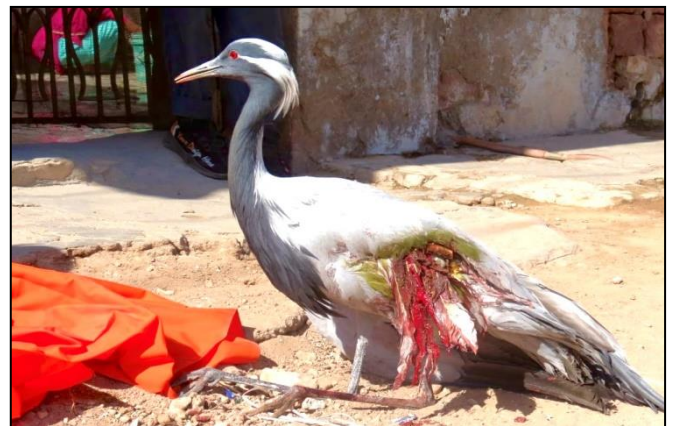
Fig -6: Demoiselle crane injured by feral dog attack.

The primary threat to the cranes in Khichan village arises from the presence of electric powerlines within the roosting and feeding grounds of the cranes. Another significant threat contributing to a high mortality rate is food poisoning. This is attributed to the ingestion of fertilizers and insecticides used in agricultural practices, which contain elevated concentrations of phosphorus. The cranes consume these substances through food grains or water in the ponds, which serve as their roosting sites and are contaminated by fertilizers and insecticides.