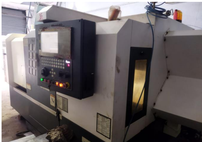
Fig-1: CNC Machine