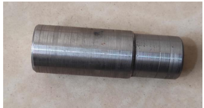
Fig-2: Workpiece after turned