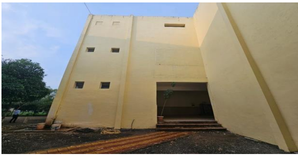
Fig -1: Civil Department Building