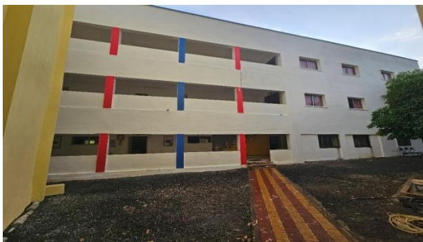
Fig -2: Mechanical Department Building

The following specifications were obtained as a result of the conducted survey: