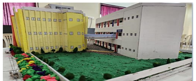
Fig -5: Side view of modular representation of proposed footbridge in JCOET Campus