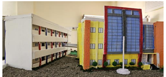
Fig -4: Front view of modular representation of proposed footbridge in JCOET Campus