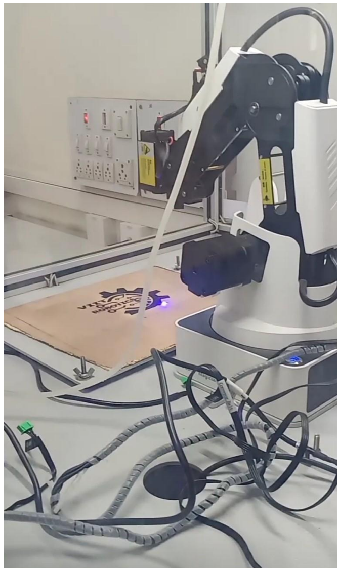
Figure 6. Laser engraving on wooden plank

Figure 6 shows a dobot engraving my department logo on a wooden plank. [9] Drawing and laser engraving both use the same graphical user interface. Adjust the zero point and direct the laser beam towards the desired material while laser engraving for the first time. Zero point adjustment refers to aligning the laser nozzle's end effector with the surface of the work item being engraved. In essence, the zero point does not have zero value since it makes sure the laser nozzle only contacts the target surface.