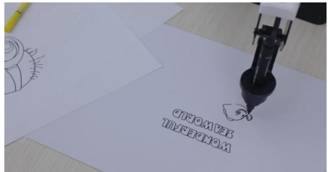
Figure 5. Robot arm Writing and Drawing using a pen [7]

Because of its exceptional precision and stability, the Dobot Magician can draw smooth lines. Customized artwork may be sent into Dobot's software to be translated to code and then drawn on paper by the arm. Similar settings can also be used for custom text. It may be a great ally for creatives. A robot arm can also be used for calligraphy, portraits, and much more.