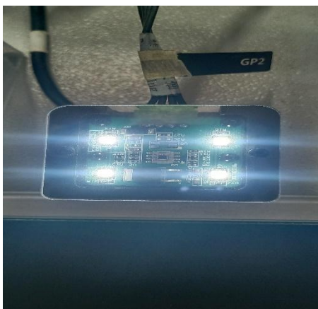
Figure 2. A colour sensor

As seen in figure 2, the colour sensor is utilized to determine an object's colour. It determines the RGB color's light intensity and outputs a result in accordance. It includes an inbuilt IR blocking filter that accurately detects colour. The colour sensor has four analogue to digital converters.