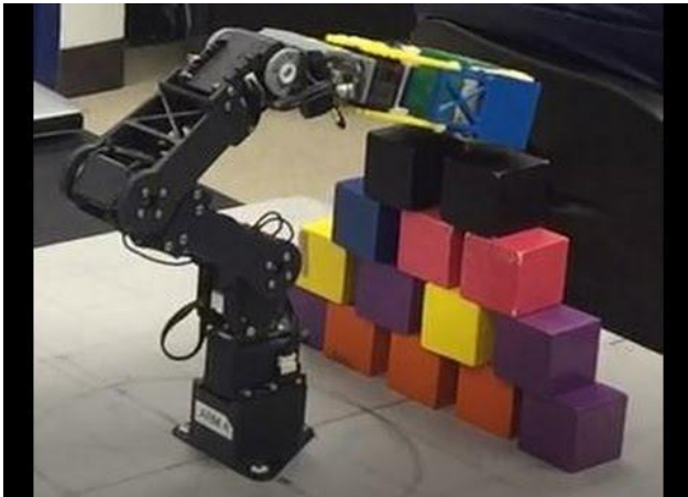
Figure 3. Stacking blocks using a robot arm [5]

Figure 3 shows a robot arm stacking the blocks one above another and forming a pyramid. Stacking is the process which does not require a lot of thinking and therefore it is pointless to appoint a human being to perform that job when machines can do it tirelessly. A robot arm is the best possible choice for it. It can carry heavy loads as well and at times can be very flexible as well. Different end effectors can be used and that too of different sizes as per the requirement. A gripper and the suction cup are among them.