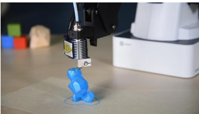
Figure 4. Cool 3D printing robotic arm [7]

[7] Dobot Magician can engrave not only lines but also shaded sketches of pictures by simply swapping the pen with a laser end-effector. Harder materials like leather and wood may be engraved with its strong laser head. It's a fantastic tool for creating artwork and unique gifts.