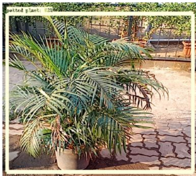
Figure4:Detection of obstacles

Figure 4 and Figure 5 show outdoor object detection like vehicles and potted plants.