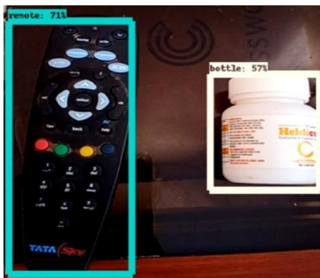
Figure 2: Detection of day to day objects

The system creates bounding box with appropriate class labels and confidence score. Confidence score here means the probability that a box contains the object represented in percentage. Figure 2 and Figure 3 depict indoor objects and obstacles like bottle, chair, remote etc.