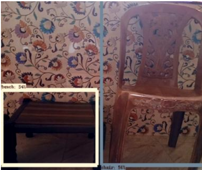
Figure3:Detection of obstacles

Figure 4 and Figure 5 show outdoor object detection like vehicles and potted plants.