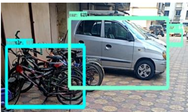
Figure4:Detection of obstacles