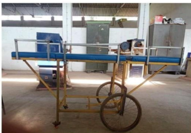
Figure 4.1 Output Figure