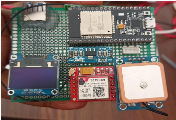
Figure.2: Final project