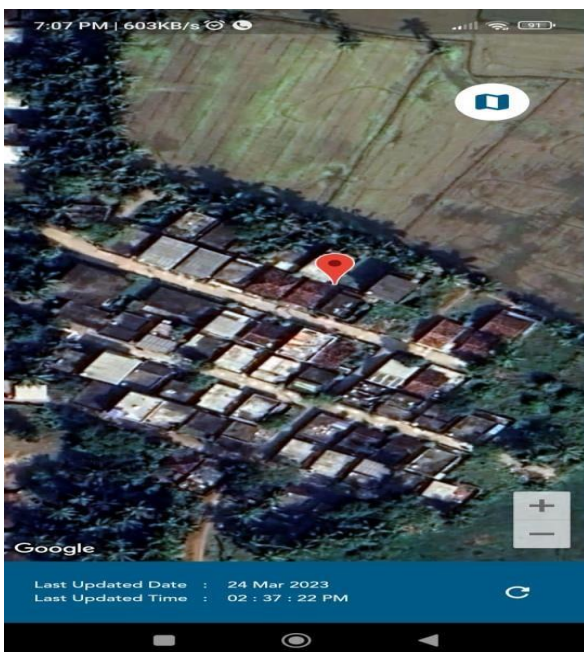
Figure.4: : Location of the user